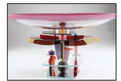
B 43 (8" H x 14 Diameter)

The Ponzini Art Glass bowl will make an elegant centerpiece for any table. The bowl itself is kiln fired slumped glass, sandblast etched and then color pigmented.