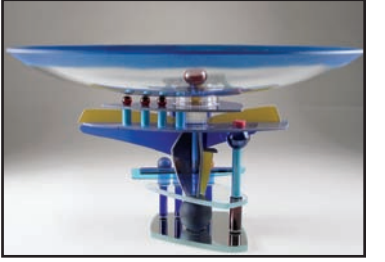
B 41 (8" H x 14 Diameter)